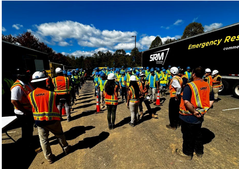
SRM team gathered before going to work a shift at ACA.