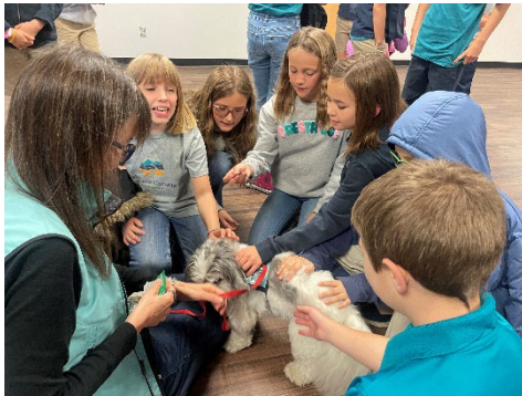
Therapy dogs greeted students on their first day back to school!

It has been one month since Hurricane Helene brought destruction to WNC and specifically to our own beloved school. We wanted to take a moment to update our entire community, including our sister schools and friends from around the country who have reached out to us offering support. We have some encouraging news to share, so please keep reading!